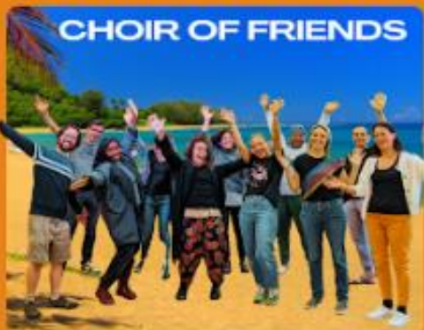
CHOIR OF FRIENDS