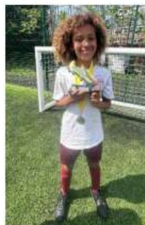
Overall Highest Goal Scorer