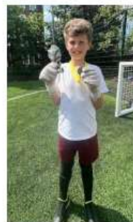
Best Goal Keeper